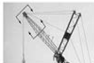
36 Top View to job left or job right