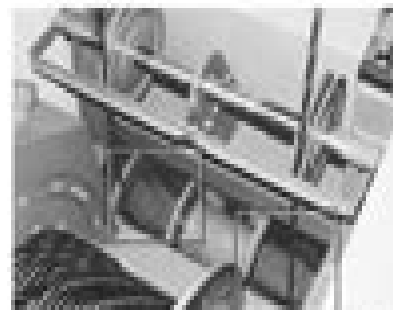
36 Front View to front top