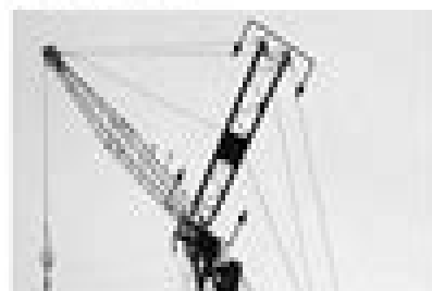
36 Side Support for job