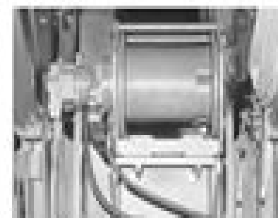
36 Front Support for job