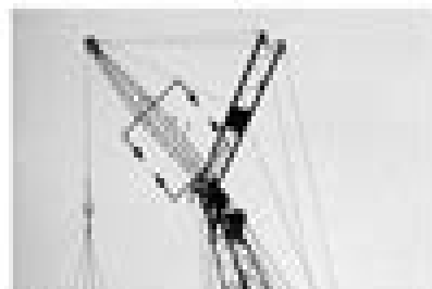
36 Front View to front top