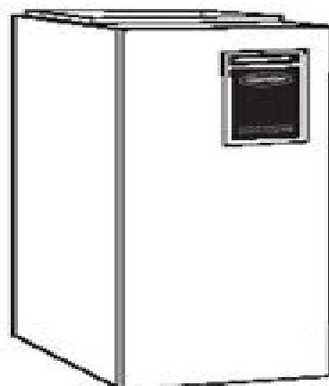
Fig. 1 - Furnace in Upflow Orientation