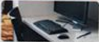
Compact, Space-Saving Design