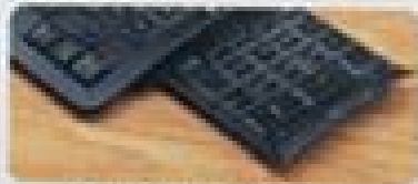
Extraordinary Numbers Keypad