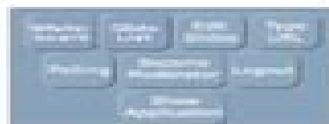
Figure 2. Instructor Control Panel