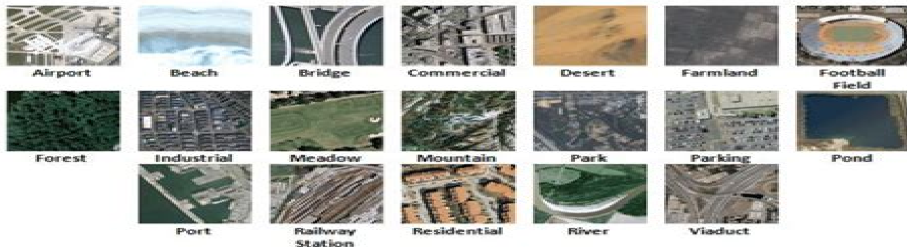
(b) WHU-RS dataset