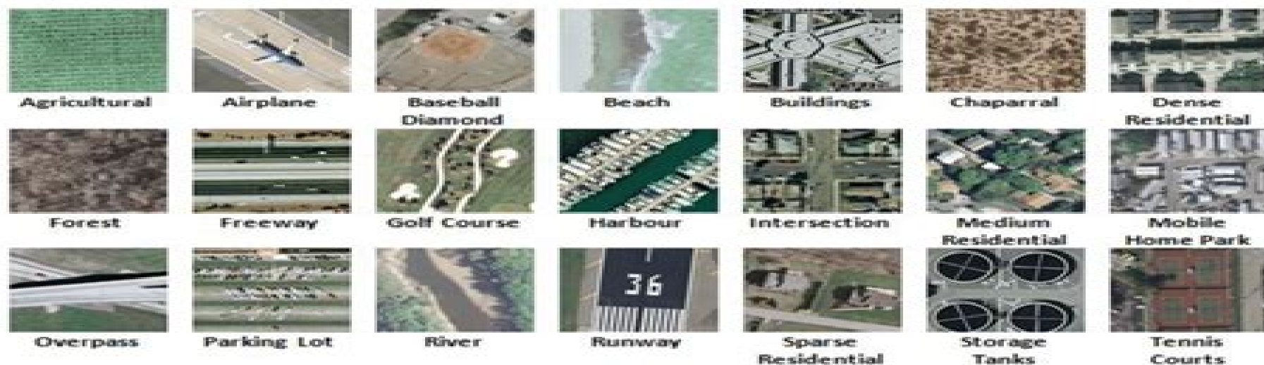
(a) UCMerced dataset