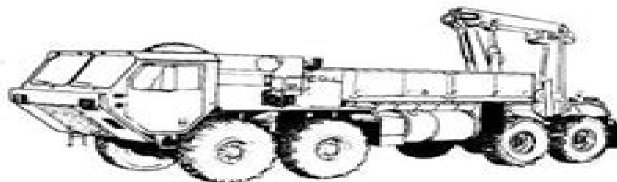
LEFT FRONT VIEW