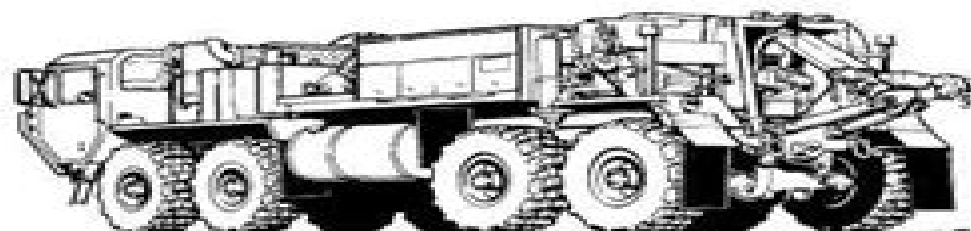
LEFT REAR VIEW