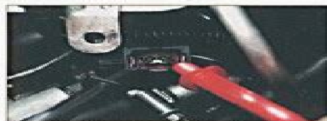
Fig. 2.1. Medida da tensão de alimentação da resistência de aquecimento da válvula VAS.