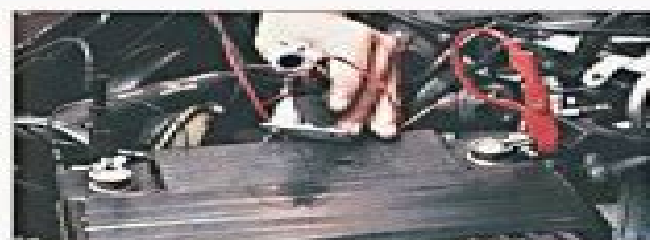
Fig. 4.1. Tensão aplicada entre os bornes da válvula VAS.