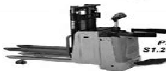
P2.0SD S1.2-1.5S I. L.

This manual is addressed to the skilled technicians of Hyster service network.