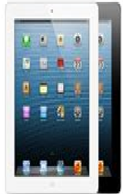
iPad avec écran Retina