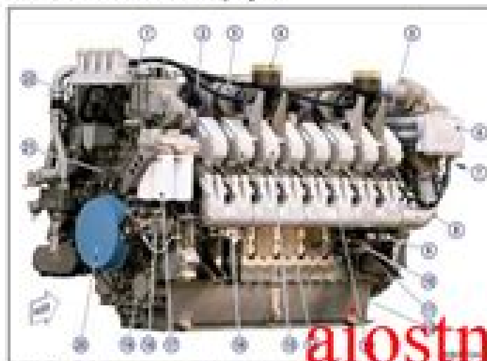
Illustration valid for 8P1216V 4000 Gey engine