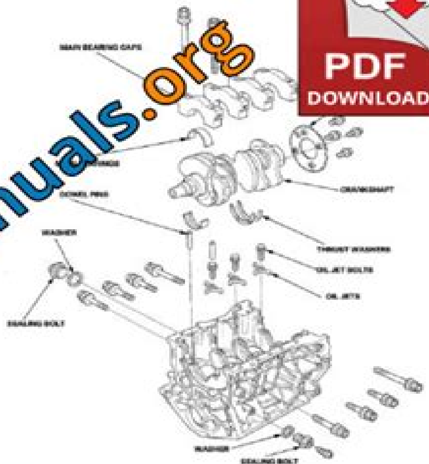
Fig. 3: Identifying Engine Block Assembly Replacement Components (2 Of 3) Courtesy of AMERICAN HONDA MOTOR CO., INC.