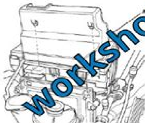
Fig. 58: Identifying PCM Cover (Kelvin PCM)