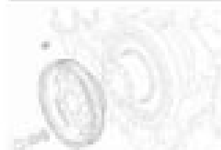
FIGURE SYMBOL DRAWING NO.