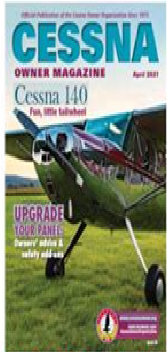
April 2021 Issue