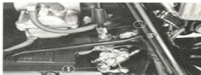
Fig. 3-2 ① Marks on control lever and oil pump ② Adjusting screw ③ Lock nut