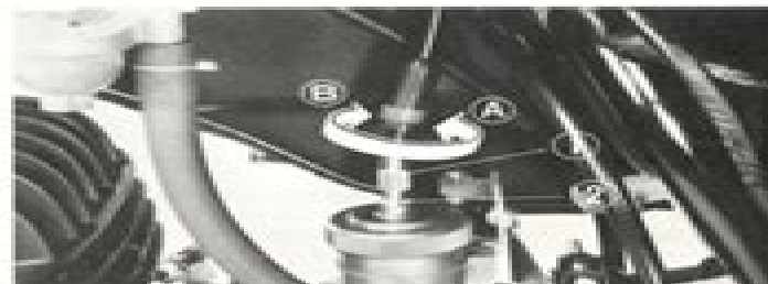
Fig. 3-3 ① Adjusting screw ② Lock nut