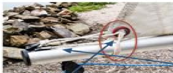
Tie clew to boom