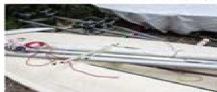
Mast in two sections: