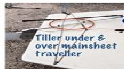
Tiller under & over mainsheet traveller