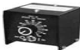
RHC-14 Hand Control #129 340

North and South rotary-motion fingertip control fastens to TIG torch using two Velcro® straps. Includes 28 ft (8.5 m) control cord. Great for applications that require a finer amperage control.