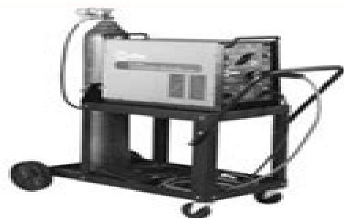
Universal Carrying Cart and Cylinder Rack #042 934

This cart adds convenience to the Econotig package. The power source mounts securely to the top, and a cylinder rack supports the argon cylinder. The bottom tray can hold electrode leads or welding hood, gloves, etc. Cylinder rack will accommodate 6–9 in (152–228 mm) diameter, and 24–56 in (610–1422 mm) high cylinders. The cart also supports five standard TIG filler metal tubes and one Stick welding rod tube. Net shipping weight is 69 lbs (31 kg).