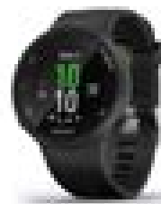
GARMIN FORERUNNER 45