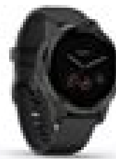
GARMIN VIVOACTIVE 4S