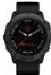
GARMIN FENIX 6