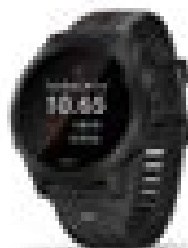
GARMIN FORERUNNER 945