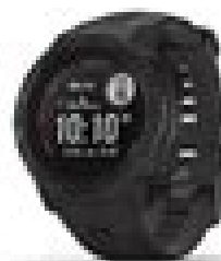
GARMIN INSTINCT SOLAR