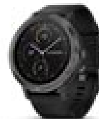
GARMIN VIVOACTIVE 3