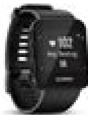
GARMIN FORERUNNER 35