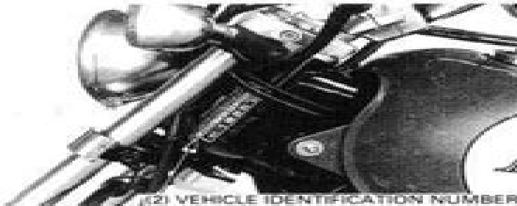
(2) VEHICLE IDENTIFICATION NUMBER

(1) The frame serial number is stamped on the right side of the steering head.