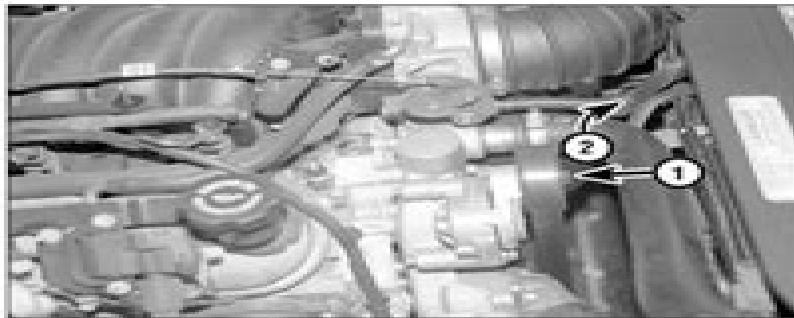
24.11 To remove the drivebelt, rotate the tensioner bolt (1), clockwise (2) to relieve belt tension (2007)