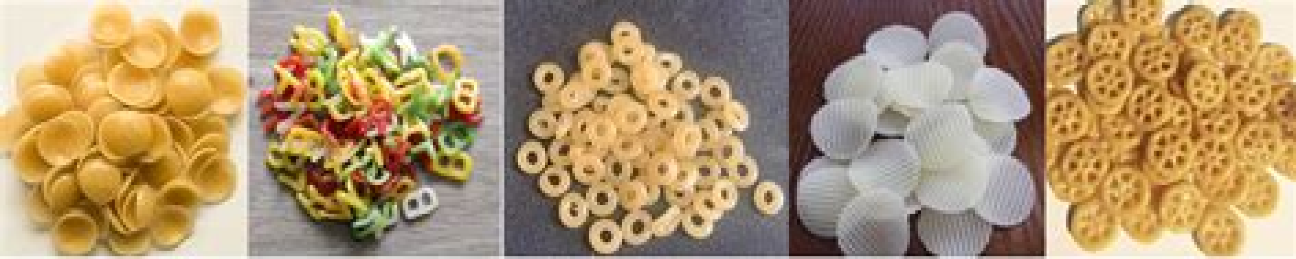
2D fryum pellets snack food