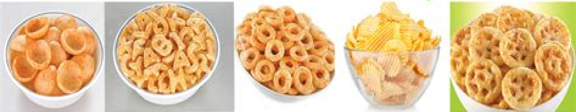
after fried and turned into a delicious snack