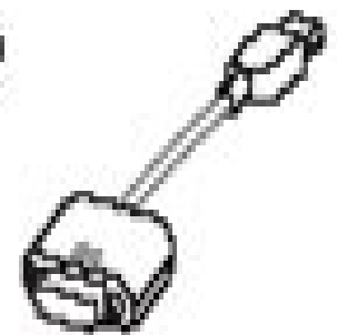
Micro-DVI to DVI Adapter