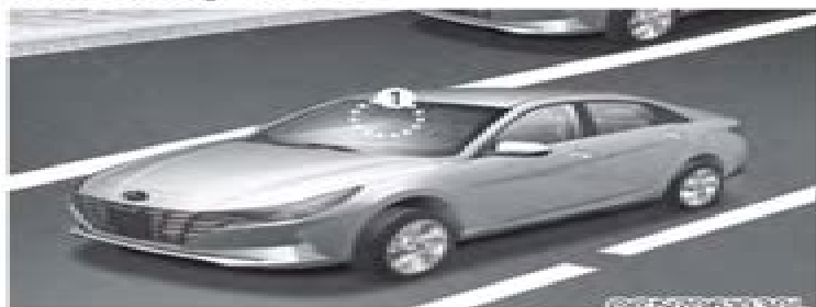
[1]: Front view camera

Refer to the picture above for the detailed location of the detecting sensor.