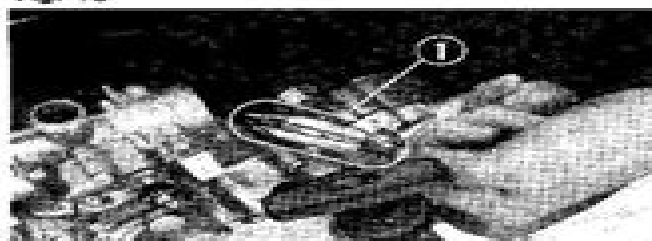
① Coupler Fig. 16