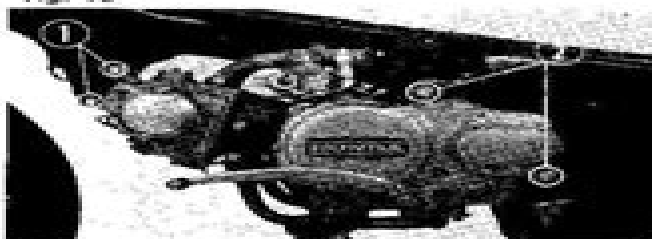
① 8 mm engine mounting bolts ② 10 mm engine mounting bolts Fig. 17

10. Loosen the tensioner lock arm mounting bolt and remove the brake pedal spring and 10 mm nut, and then slide off the tensioner lock arm. Remove the brake adjuster nut and the brake pedal.