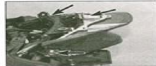
10.8 Tail light bolts (arrowed)