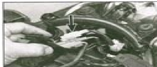
10.7 Disconnect the wiring connector (arrowed)