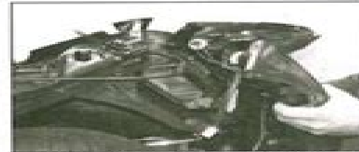
10.3c ...and remove the assembly...