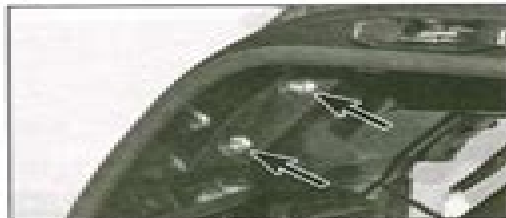
10.3b ...and the tail light screws (arrowed)...