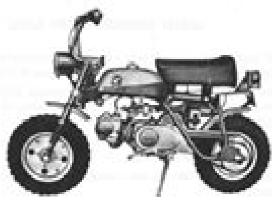
TYPE (From F. No. 120001)