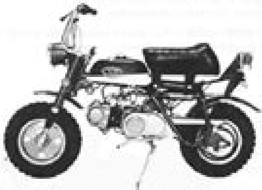
U.S.A. TYPE (From F. No. 270201)