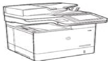
M631dn Flow M631h M632h M633fh