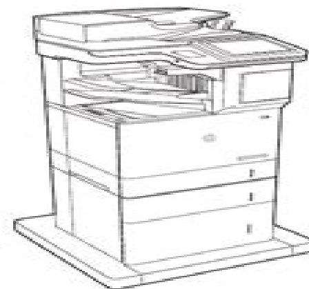
Flow M632z Flow M633z